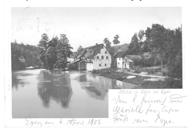
Cheb paper mill. Picture postcard before 1901.

But let's return to our main focus. The question stands regarding the above mentioned paper mills. Ask any common Czech now about a paper mill in Cheb and the answer will be, "No, there is nothing