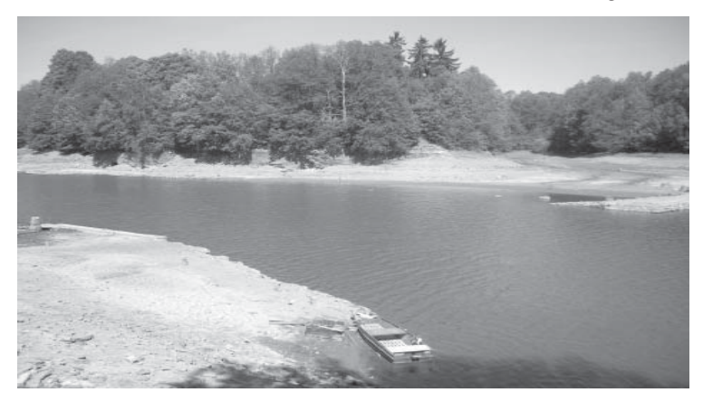
Photo of the site of the Cheb paper mill in June 2007.

The so called "Egertal" (the Ohře-Eger river valley in German) was once a very famous and popular recreation area with roads along both river banks, a couple of weirs holding water and producing small lakes, several restaurants, and an outlook tower called "Egerwarte" (Chebská hlídka or stráž, meaning